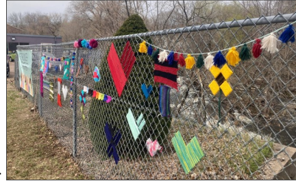
Yarn bomb on FSC's fence!

In the community, we co-facilitated a special SAAM installment of the L.E. Phillips Memorial Public Library's Tough Topics Book Club, where we discussed Garrard Conley's memoir Boy Erased . Tangled Up In Hue opened their doors to a SAAM Stitch & B*tch event where participants brought their own craftwork, or tried their hand at SAAM-related projects, including pinback button pressing, message bracelet-making, and painting rocks for the FSC Peace Garden. Some of the knitted and crocheted pieces created were then used to construct a colorful, evolving "yarn bomb" installation on the fence outside FSC's Chippewa Falls office. Tangled Up In Hue also designed a special t-shirt for SAAM,