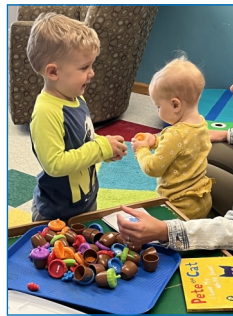
Family Game Day!

River Source Family Center has been partnering with childcare providers in Chippewa County. RSFC was able to offer working parents