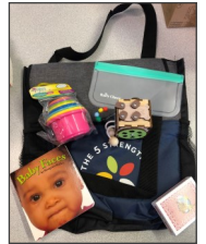
Parenting on the Go bag!

with children in Family childcare a Parenting on the Go bag . 100 bags were given out to local families and included age appropriate toys and activities, which promote play and positive relationships.