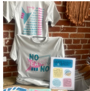
SAAM t-shirts at Tangled Up In Hue

which is available in-store and online for the next three months, with proceeds benefitting FSC. CASA collaborated with UW-EC Gender & Sexuality Resource Center to organize an on-campus Sexual Health Fair. FSC and CASA had adjoining tables at the event and